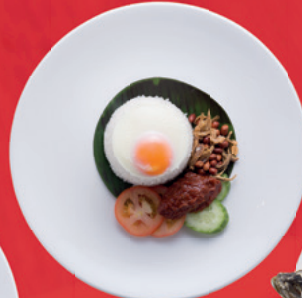
Nasi lemak 75 sec