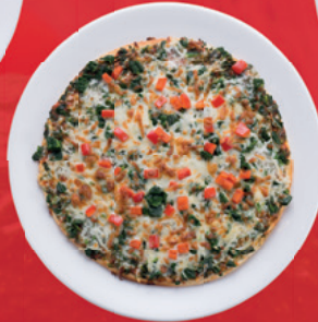
Pizza 140 sec