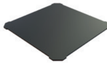
Solid cook plate Part Number: DC0322

For further accessories, please refer to our Merrychef eikon® e1s Accessories Brochure.