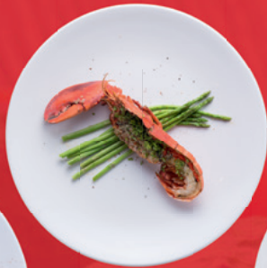
Lobster 60 sec