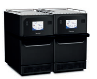
Adaptor for eikon® e2s Twin